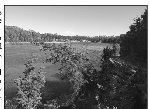
East Quarry in the Fall.

The WRLC and Cleveland Museum of Natural History both have "conservation easements" over the two